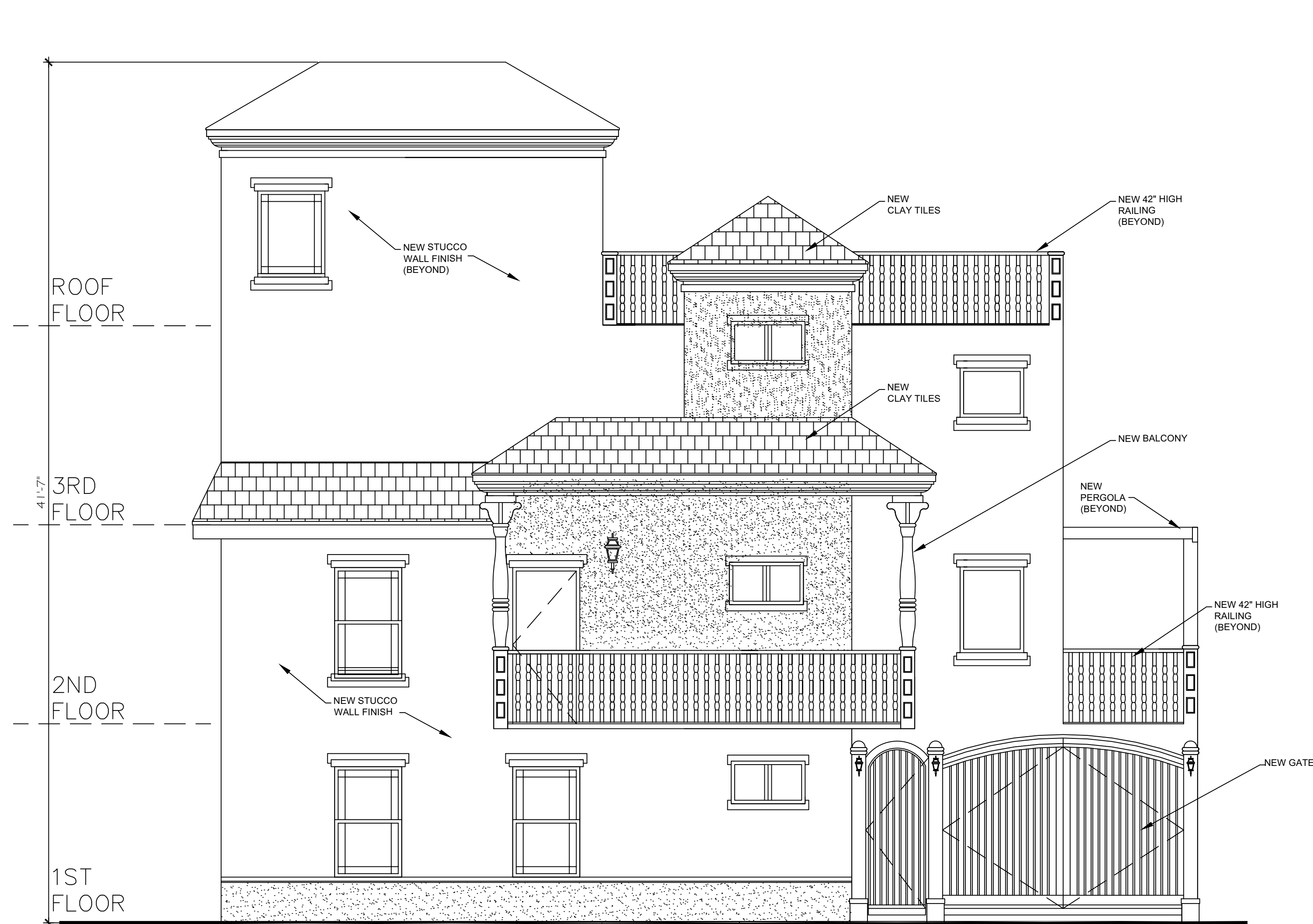
FRONT ELEVATION (WEST) SCALE 1/4" = 1'-0"